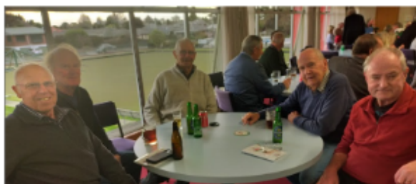
...as were the men