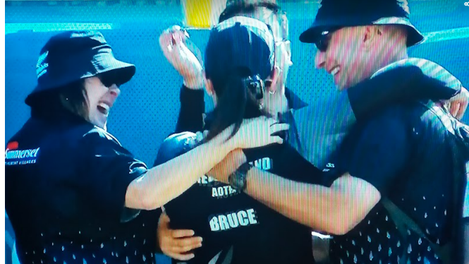
Sharing the thrill with Mum and Dad