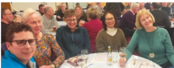
Women members were enjoying the day...