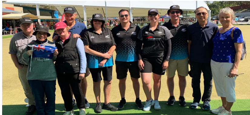
Burnside members out in force on the Gold Coast during the week.