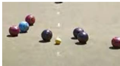
Bowls NZ YouTube