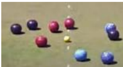
Red and black bowls from the Burnside pair