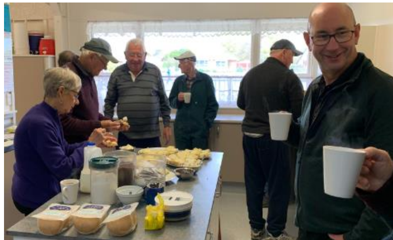
Definitely not junk.