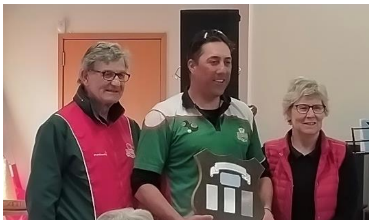
The New Season Trophy Winners:

Only three players won all four of their games, all from the same green and each filling a different playing position. They took the trophy home.