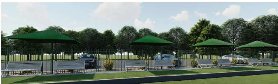
Artistic impression of the proposed Orchard green sunshades.